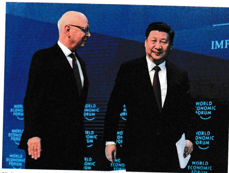
Xi Jinping meets with Klaus Schwab, founder and executive chairman of the World Economic Forum in Davos on January 17, 2017.

In addition to the Davos meeting, the state visit to Switzerland also included visits to some international organizations. ■