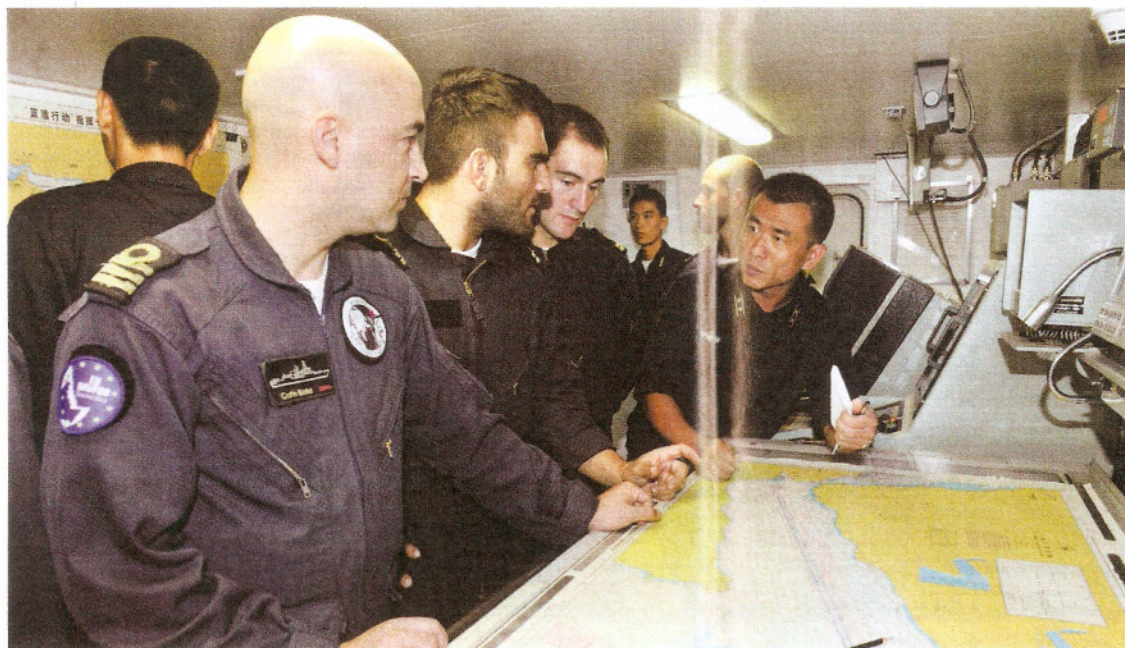
MILITARY TALK: Chinese and EU escort task forces communicate on escort issues