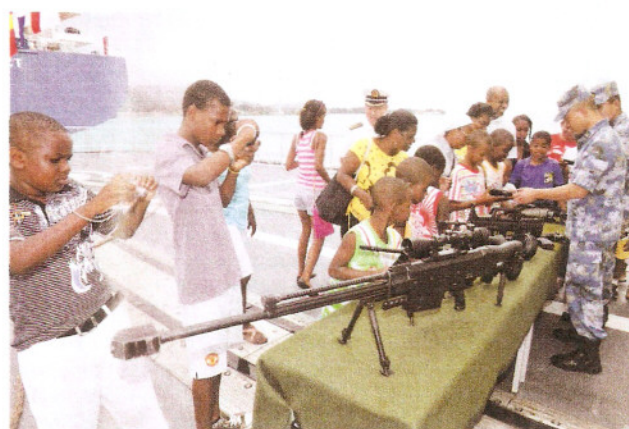
WEAPON SHOW: Children from Elizabeth Orphanage in Seychelles examine weapons onboard the Harbin when Chinese escort warships called at the country's port of Victoria on June 16-20