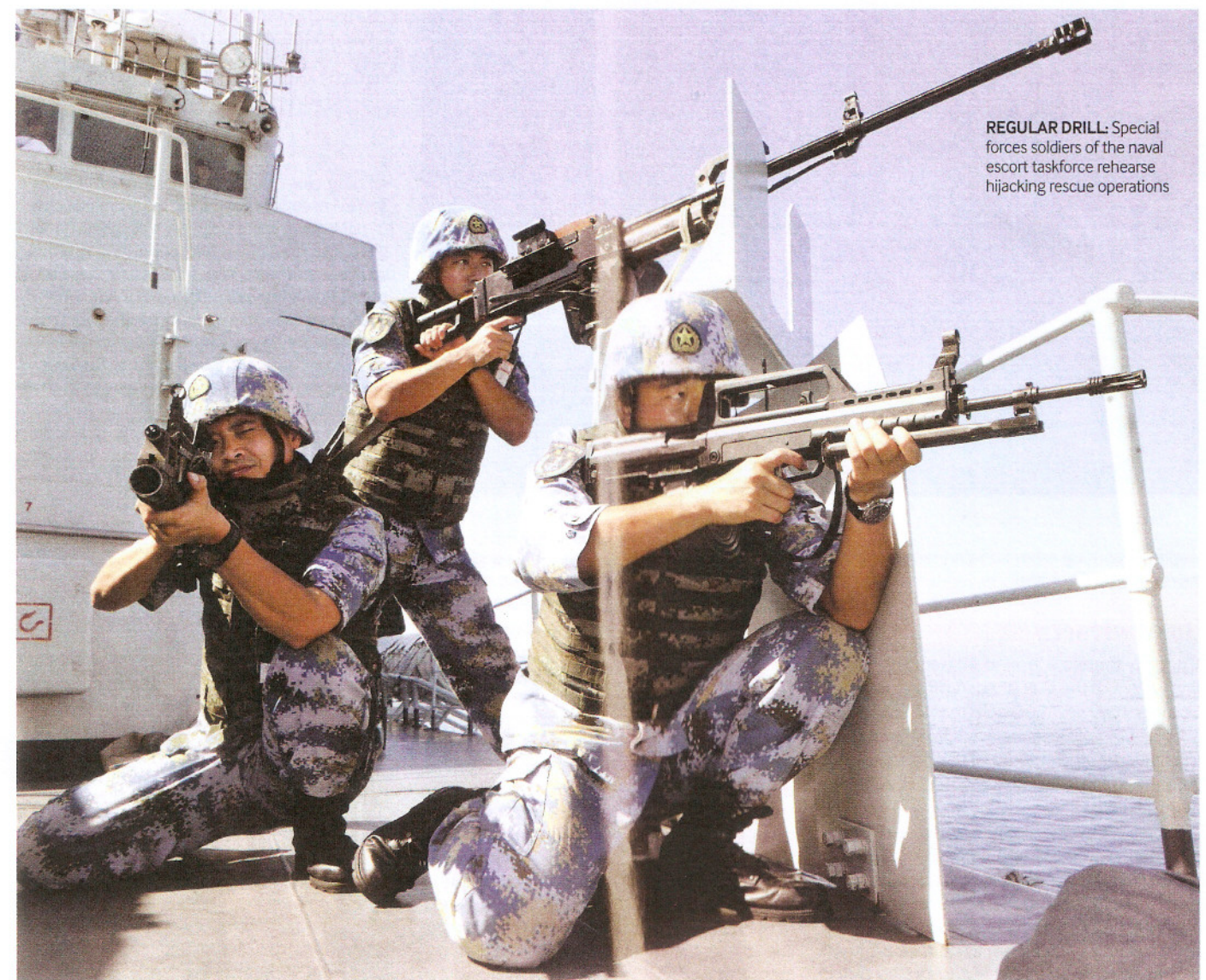
REGULAR DRILL: Special forces soldiers of the naval escort taskforce rehearse hijacking rescue operations