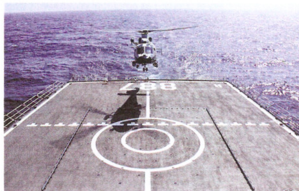
SAFE LANDING: A helicopter lands on the supply ship Weishanhu