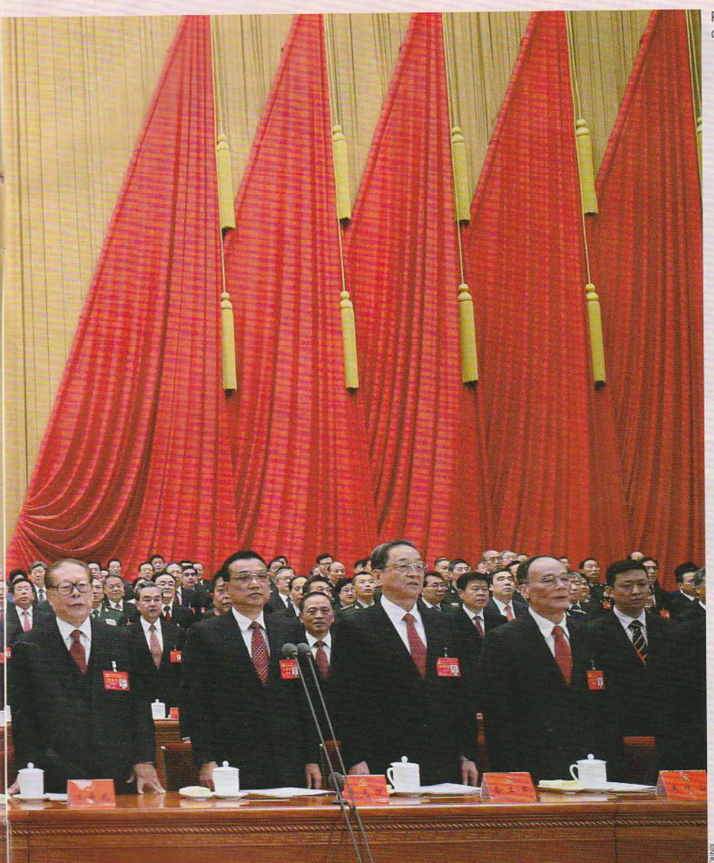
Party leaders attend the opening session of the 19th CPC National Congress

Xi said while China's overall productive capacity has significantly improved and in many areas leads the world, the problem is that the country's development is unbalanced and inadequate. This has become the main constraining factor in meeting the people's increasing needs for a better life.