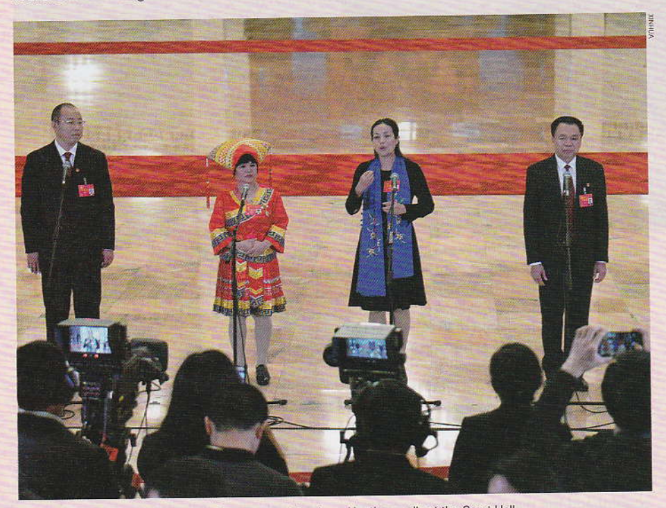
Delegates to the 19th CPC National Congress are interviewed by the media at the Great Hall of the People in Beijing on October 19

CPC celebrates its centenary in 2021, and to turn China into a modern socialist country that is prosperous, strong, democratic, culturally advanced and harmonious by the time the People's Republic of China celebrates its centenary in 2049.